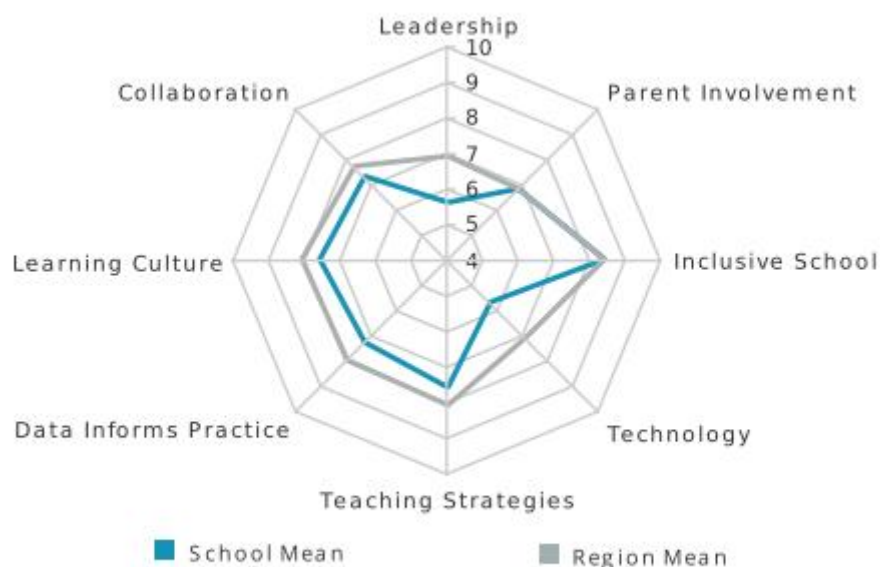
TEACHER SURVEY SNAPSHOT