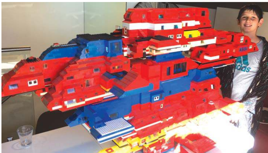
Featuring Australia's largest interactive Lego™ Spaceship. It has to be seen to be believed. It's made up of 12 connecting spaceships.